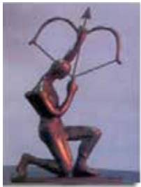
Arjuna Award fine."

Within a few weeks of commencing holistic therapy I