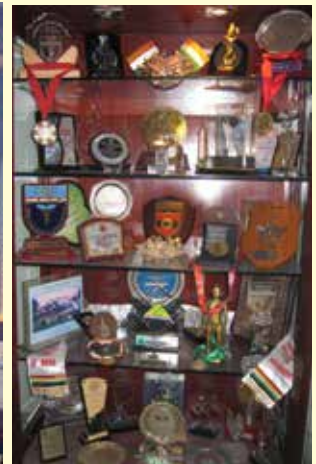
Gallery of Prestigious Awards