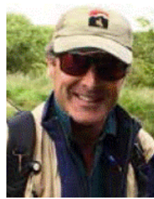
Beneficiary from Kew, 3101 Victoria, Australia